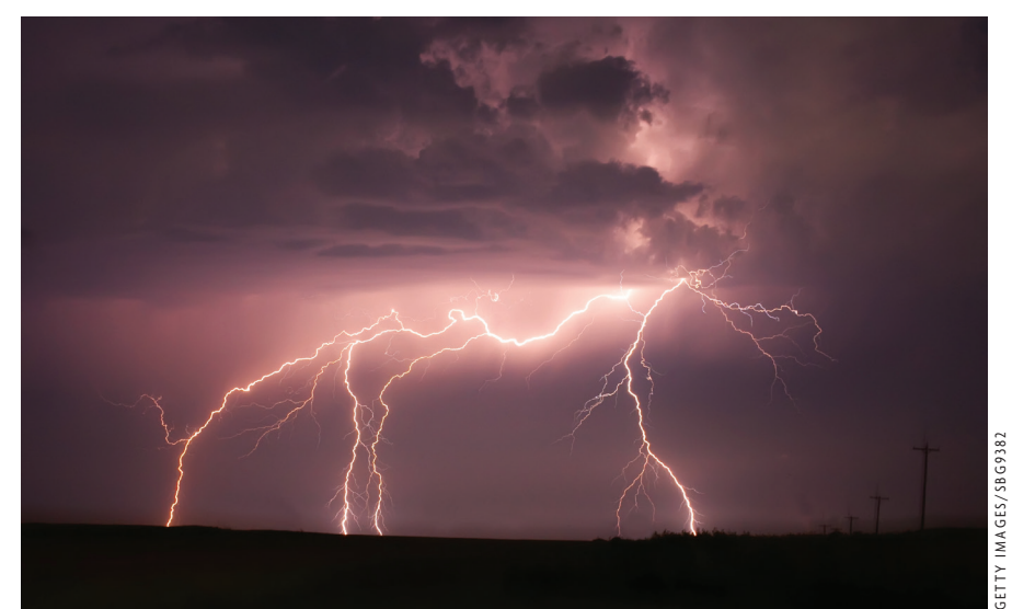
Prepare for the upcoming summer storm season by reading the tips above to stay safe during and after a storm.

member of Touchstone Energy Cooperatives since 1998. Along with 750 electric cooperatives nationwide, we have partnered with Touchstone Energy to put safety as our number one priority. For a checklist to assess safety hazards around your home or to take a quick safety quiz, go to www.togetherwesave.com/ power-of-community/safety.