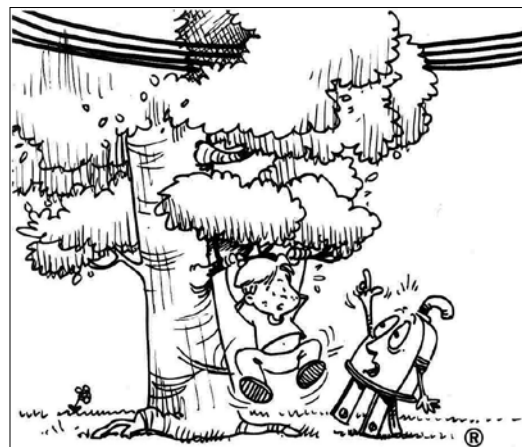
Never climb trees near power lines. Even if the power lines aren't touching the tree, they could touch when more weight is added to the branch.

"Use caution when plugging in electrical appliances outdoors," says Hall. "Such handy items as radios or bug zappers can generate an electric shock. Exterior outlets should have